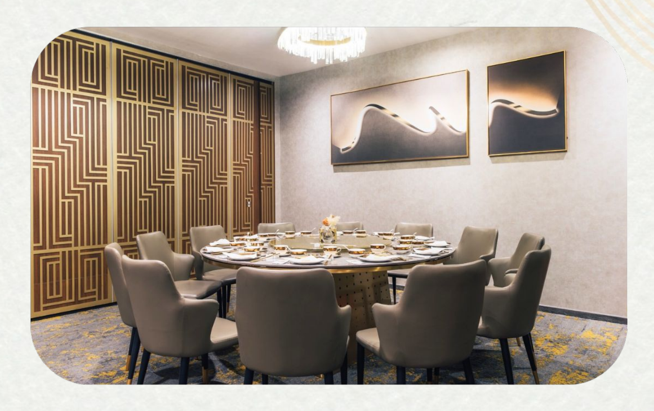
A Royal Dining Experience