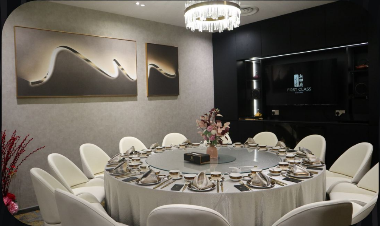
A Royal Dining Experience